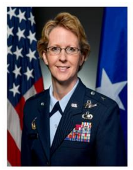
Figure A5.1. Head and Shoulders Photography Examples

A5.2.2. Video Studio Specialized Requirements: Video studios should have specialized sound-proofing to accommodate professional audio recording capability. All video studios require backdrops, specialized lighting, professional cameras, and furniture and imaging systems to process the imagery. Extensive electrical and electronic support for illumination and equipment should be considered. Special fire detection and suppression equipment may be necessary. See AFMAN 32-1084.